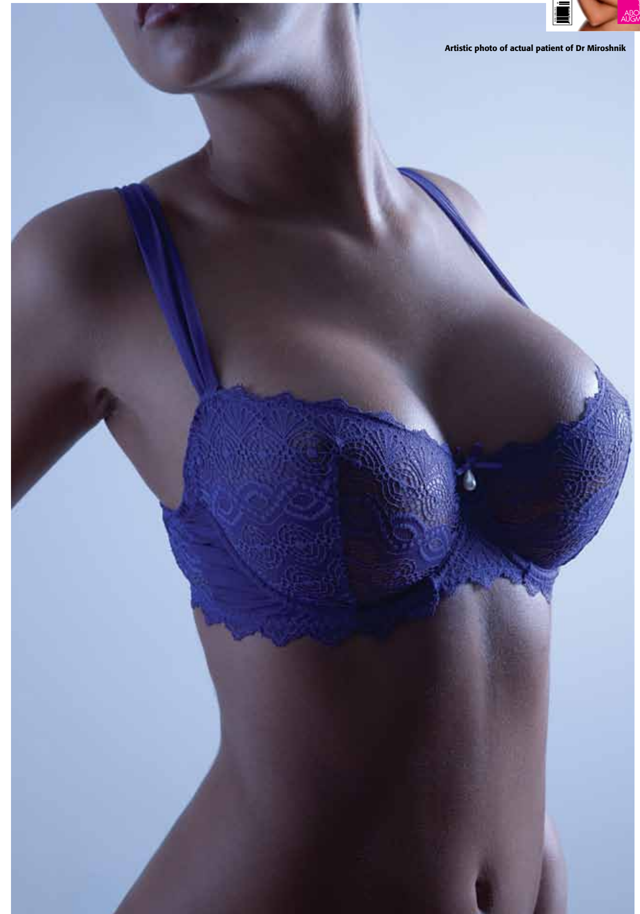
Artistic photo of actual patient of Dr Miroschnik

as seen in Your Definitive Guide to Breast Augmentation